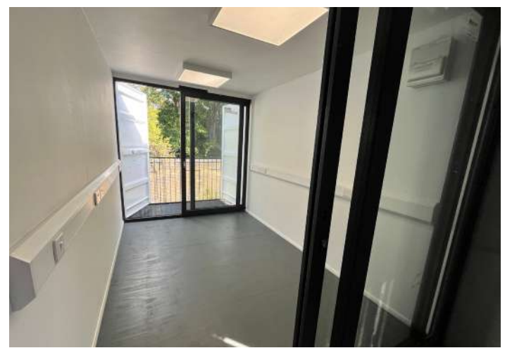
Office Space to rent at Turbine East, Hackney Wick, E9 5JH